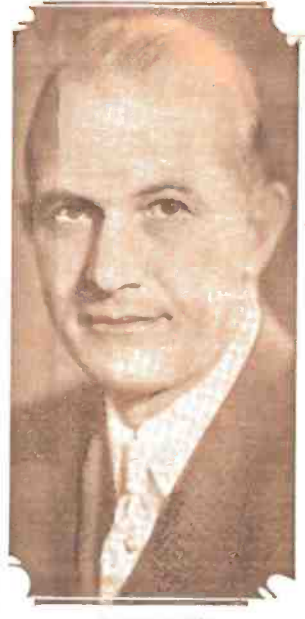
THE VOICE OF EXPERIENCE

Would it not be the proper thing for you to do the next time your rent is due to simply say to the landlord. "I pay my rent promptly. I have asked for necessary repairs to be made. You have shown no inclination to make them. Therefore I must demand that they be made before I pay this month's rent. When they are made you will get your rent; not before." I think you will find this method will bring the landlord to his senses and bring you the repairs you seek. However, if the