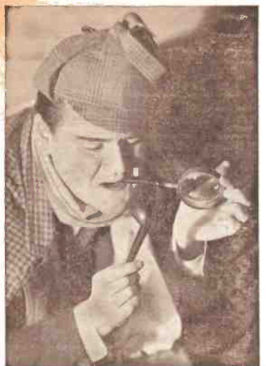
COLONEL SHERLOCKUEL Q. HOLMESNAGLE